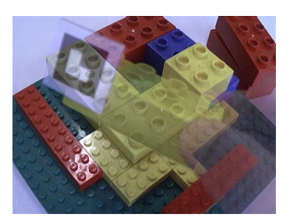
(c) The bottom edge of the brick is rendered with an alpha value of 0.9. Now it is much easier for the user to place the brick.

Figure 3: Rendering the relevant edge of a Lego brick at very high alpha values improves interaction.