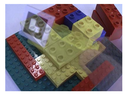
(b) Lego brick and hand are rendered at a uniform alpha value of 0.6. At this level, it is difficult for the user to determine the exact position of the brick relative to the target brick.