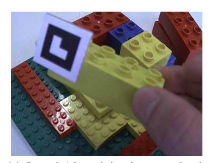
(a) Lego brick and hand are rendered opaquely. An AR Toolkit marker is attached to the brick so that its position and pose can be tracked.